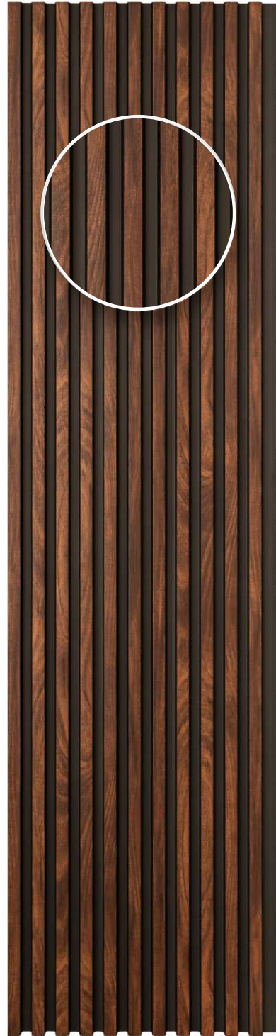
CHERRY DUAL TONE

EV-1002 2850mm (L) X 240mm (W) X 12mm (T)