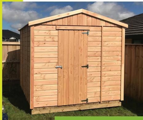
Garden Shed 2.4m x 2.5m