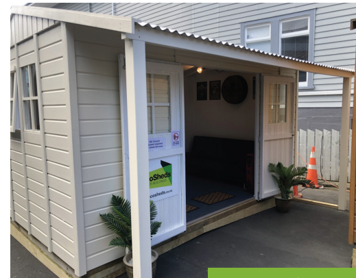
4m x 2.5m Sleepout with Verandah and lined interior