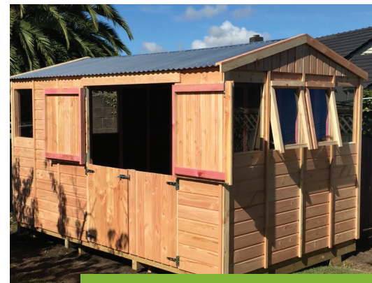
EcoShed with split barn doors + 6 windows