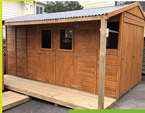
EcoShed with Verandah

Upon completion, the exterior of the building must be treated with a good quality timber sealer to maintain its durability and appearance.