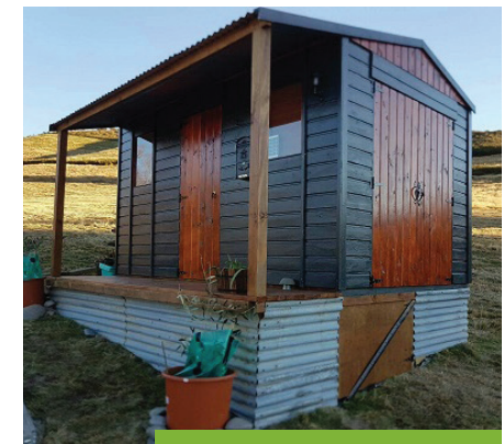
Mountain Retreat 4m x 2.5m with Verandah and 3 doors