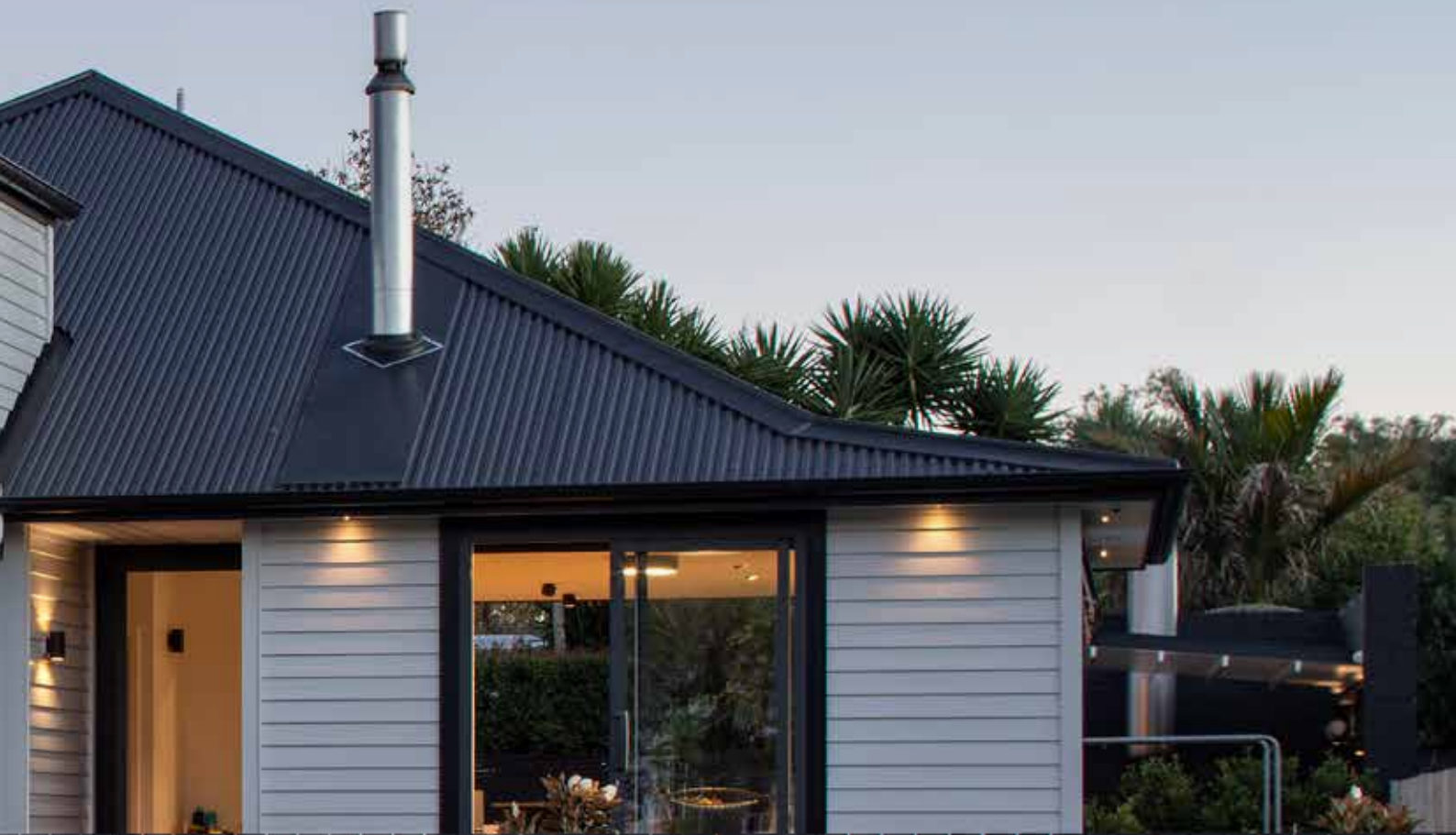
Traditional weatherboard - Slate

Refer to the maintenance guide on our website for further details. www.palliside.co.nz