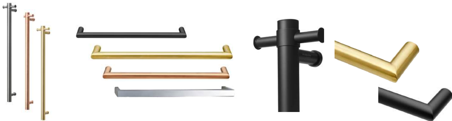
Polished Stainless Steel