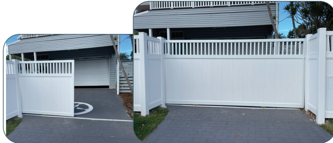
Sliding Gates [customizable]

Upgrade your property's value and security with our sliding gates. No more concerns about kids or pets wandering onto the road. We handle everything – from crafting to fitting – customised to your needs. Experience a safer, hassle-free solution today.