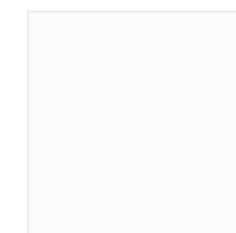
HAMPTONS WHITE Custom Colour

Your Vergola Design Consultant will assist you in selecting the ideal Vergola colour to complement both your outdoor and indoor living areas. Choose from our standard colour range or match a custom colour to suit your aesthetic.