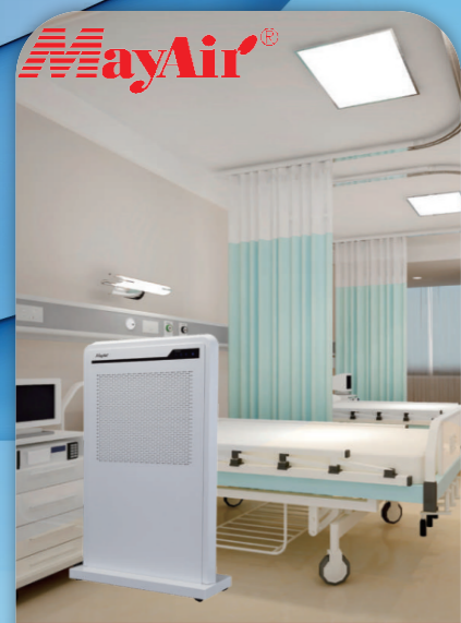
Medical & Aged-Care Air Purifiers