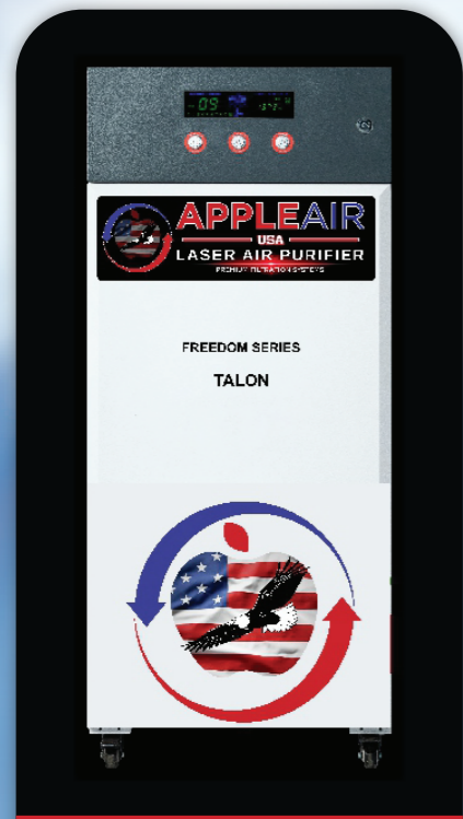
USA Laser Air purifiers Designed in Australia