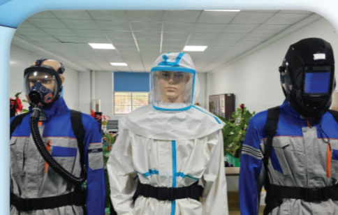
Apple Air Dust Chemical • Medical Full face respiration Automatic Welding Helmets Air purified respirators.