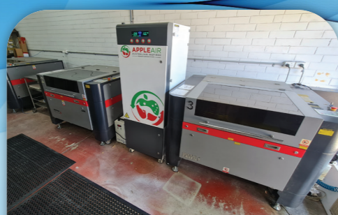
Apple Air Laser Extraction using E-Stat technology to save you $$$ in filter replacement costs.