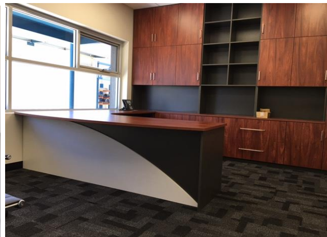
Boardroom tables, chairs, power and storage - Reception counters, signage, feature walls