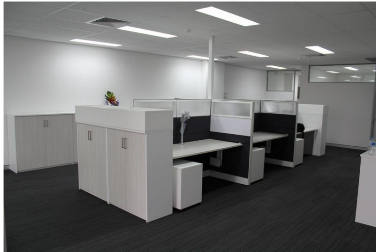
Custom executive desk systems