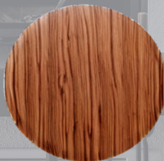
Wood Grain Dark