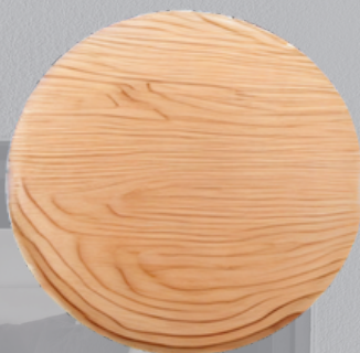
Wood Grain Light 2