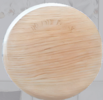
Wood Grain Light 1