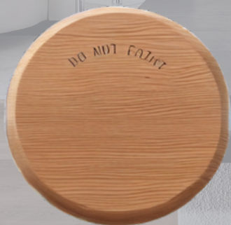
Wood Grain Medium