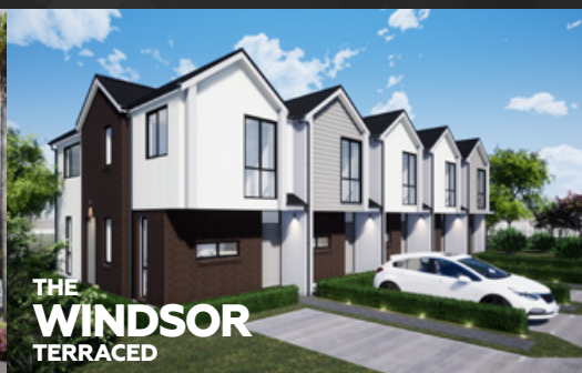
THE WINDSOR TERRACED