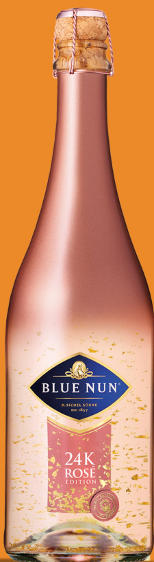
Blue Nun Wines