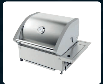
2 burner drop in BBQ Model TCS2IBL