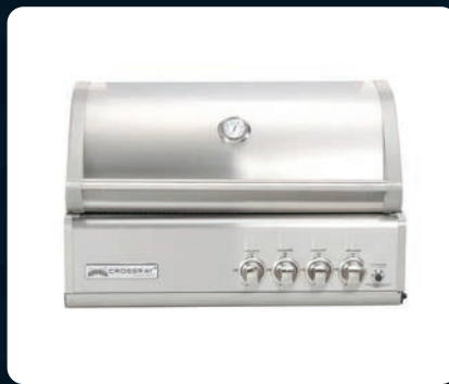
4 burner in-built BBQ Model TCS4FL