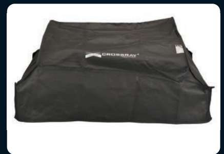
BBQ Cover TCE-COVER