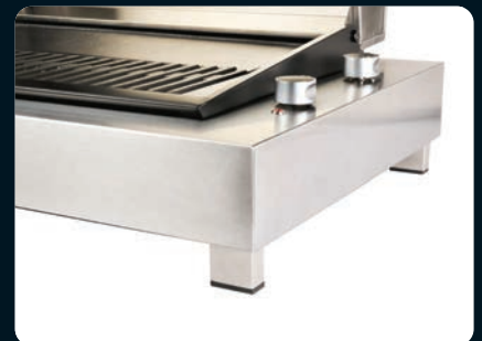
BBQ Feet TCEAC-001