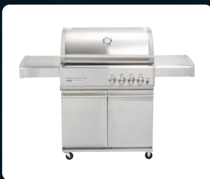
4 burner trolley BBQ Model TCS4PL