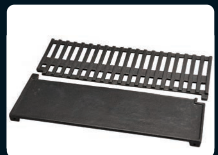
Grill & Hotplate TCE-GRILL & TCE-HOTPLATE

Robust double skin doors and fold-down top shelf provides the perfect platform for the high hood CROSSRAY Electric BBQ flush-mounted in the sintered stone bench-top.