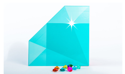
Game board and pieces