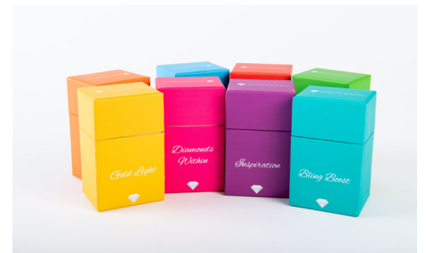
8 deck boxes