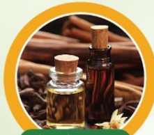
Licorice Root Extract