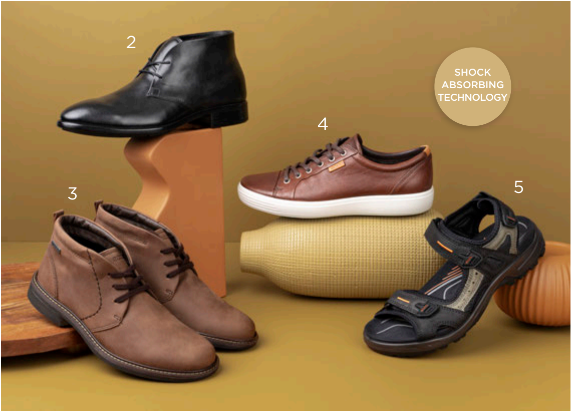
1. ST1 Hybrid 836814 $379.95 2. Citytray 512794 $279.95 3. Turn 510224 $309.95 4. Soft 7 Mens 430004 $269.95 5. Offroad 69564 Mens Sandal $229.95