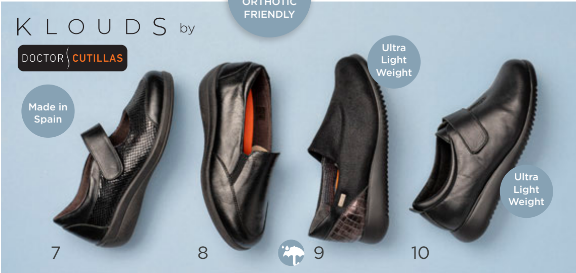
1. Omari $199.95 2. Xanthippe $279.95 3. Madonna $379.95 4. Clareen $249.95 5. Kameko $179.95 6. Cara $199.95 7. Gijon 43505 $229.95 8. Gijon 43203 $229.95 9. Eslava 86026 $249.95 10. Eslava 86021 $249.95