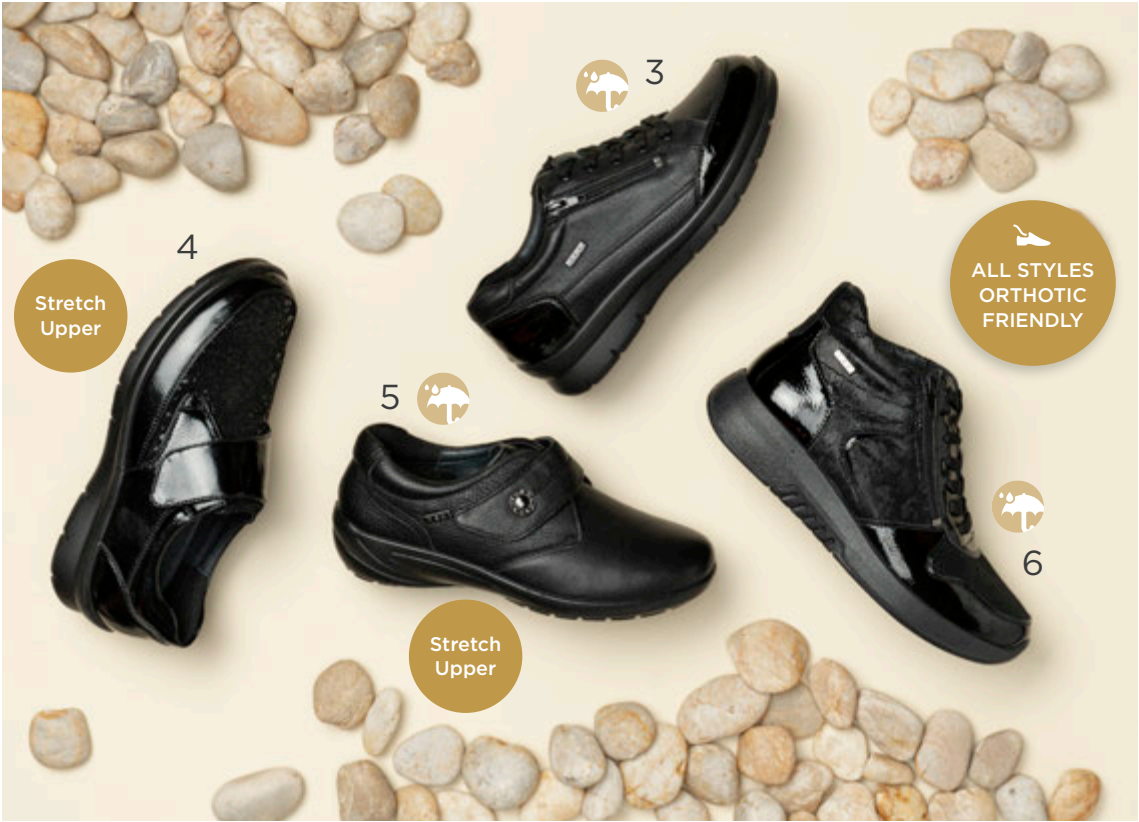
1. 929-7 $249.95 2. P-9520 $199.95 3. P-8229 $199.95 4. P-8223 $199.95 5. P-9520 $199.95 6. 5188-17 $249.95