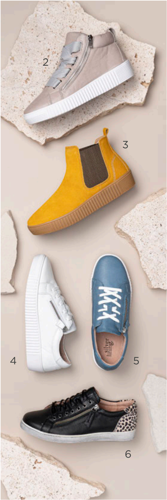
1. Vanity $179.95 2. Ventura $179.95 3. Vanity $179.95 4, 5. Victoria $169.95 6. Valencia $169.95