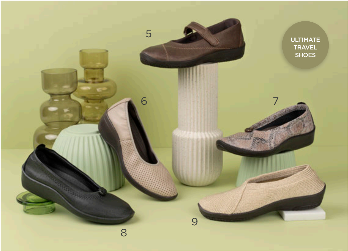
1, 2. Leina Diamond $169.95 3. L58 Pierced $159.95 4. L19 Galileu $199.95 5. L18 $169.95 6. L68 Pierced $169.95 7. L14 $149.95 8. L1 $129.95 9. Mailu $119.95