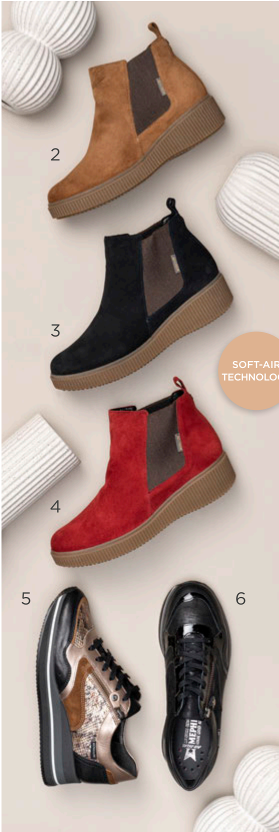
1. Karin $379.95 2, 3, 4. Elyse $429.95 5, 6. Olimpia $429.95