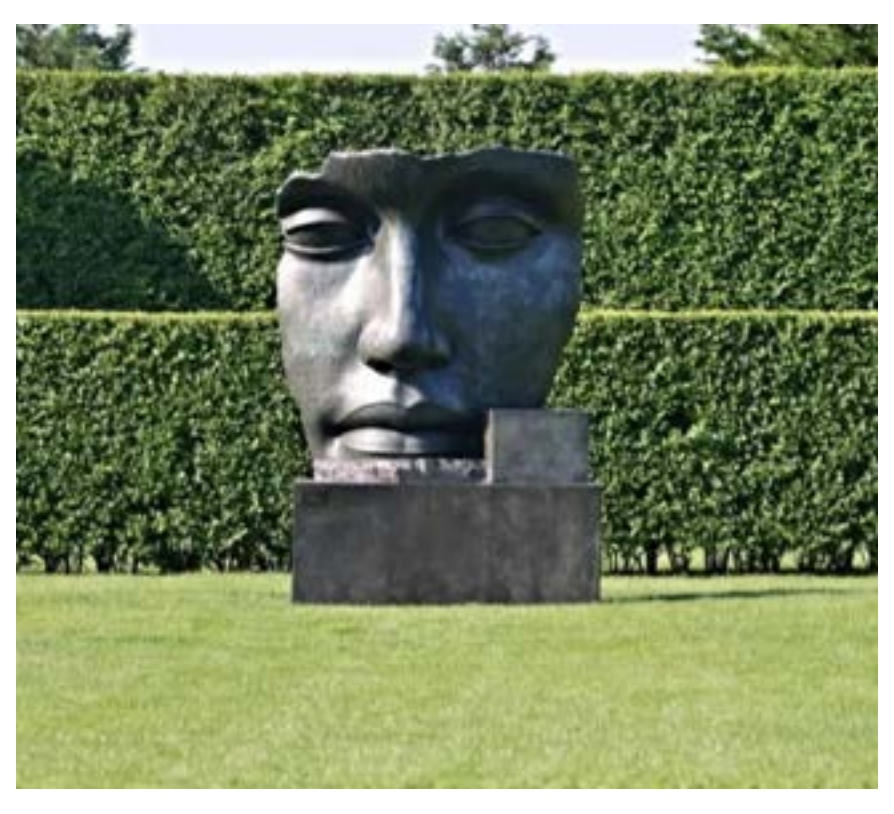
The art of Bespoke S C U L P T U R E