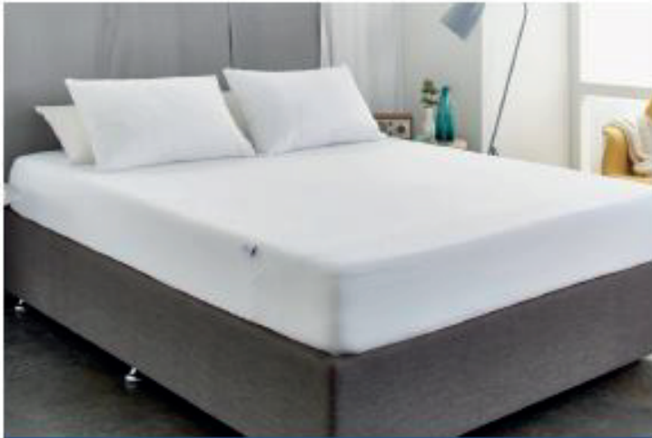
STAYNEW™ COTTON TERRY WATERPROOF MATTRESS & PILLOW PROTECTORS