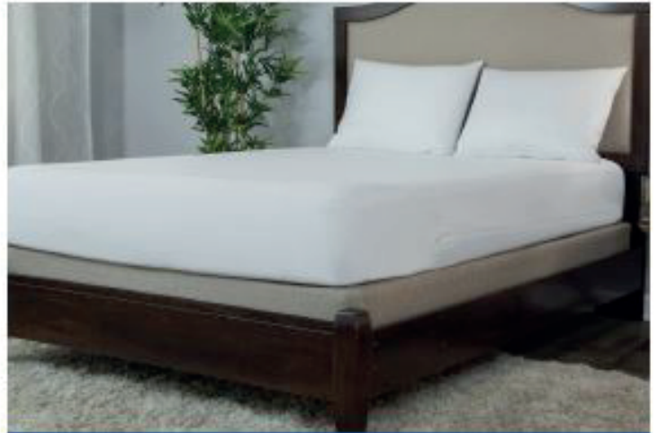
ALLERZIP® FULLY ENCASED MATTRESS & PILLOW PROTECTORS