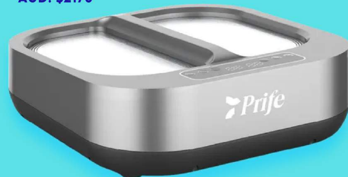
ITERA BIO-LITE USD: $1380 AUD: $2170