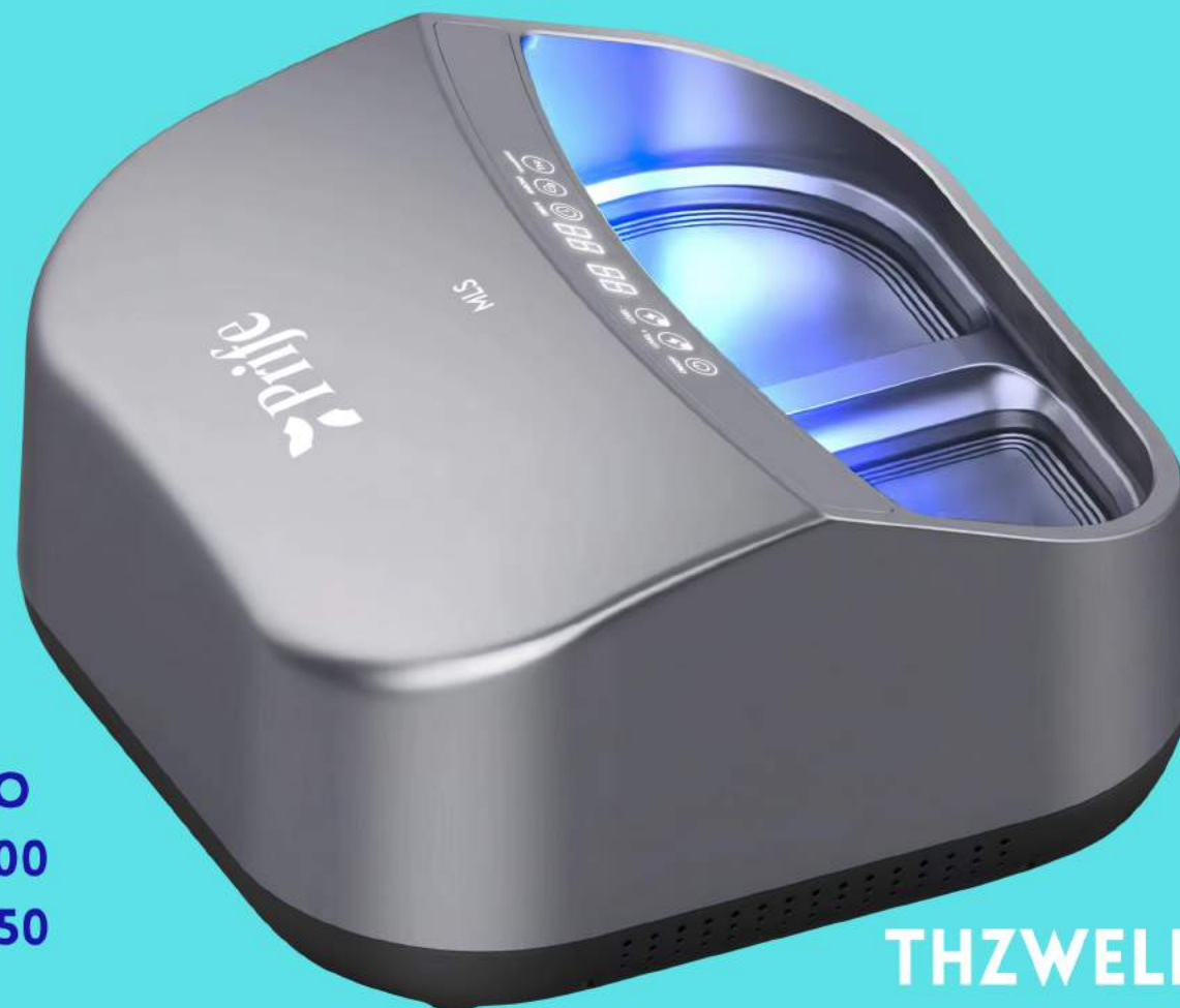
ITERA-BIO USD: $4500 AUD: $6950

IMPROVING CIRCULATION, DETOXING THE BODY, FIRMING THE SKIN, ANTI-BACTERIAL SUPPORT FOR SKIN; STIMULATING IMMUNITY & INCREASING METABOLISM