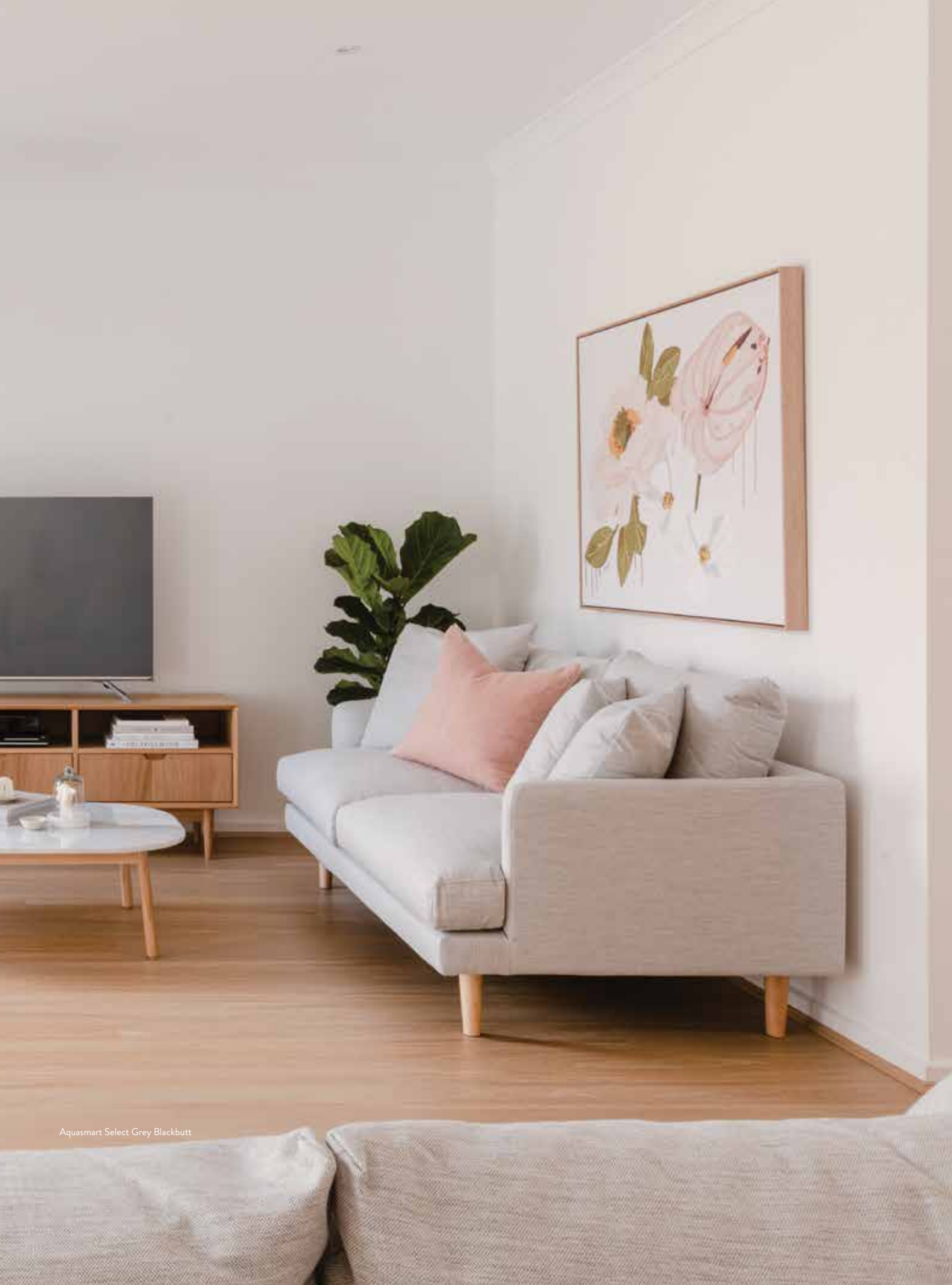
Aquasmart Select Grey Blackbutt